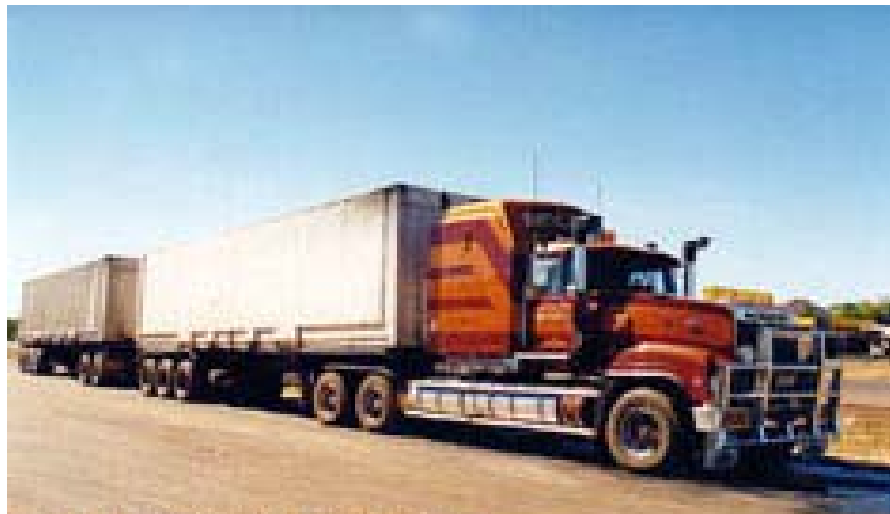
17-Point Tractor & Trailer Inspection